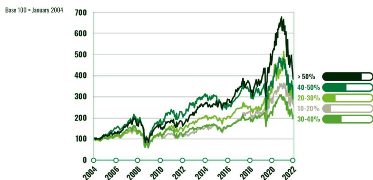
The stock performance according to the share of the company held by the same family

Looking again at the period from January 2004 to October 2022, the stocks of businesses that are more than 50%-owned by the founding family post much higher gains than companies with lower family stakes. This is largely due to better alignment between the interests of shareholders and management. Such majority-owned businesses are also less subject to the demands of minority shareholders whose interests may not be consistent with those of management and/or the company's long-term goals.