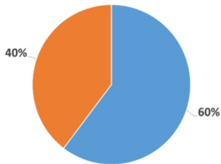
Meetings voted for/ against Management

In Q1 2022, Carmignac voted against the management of our investee companies at least once at 60% of meetings voted: