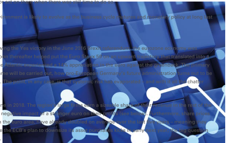
FINANCIAL CONDITIONS IN THE EUROZONE AND USA

That said, turning the European boom into stock-market gains will be easier said than done in 2018. The region's large firms earn a sizeable share of their revenues in the rest of the world, which makes them less sensitive to the eurozone upturn and exposes them to the negative impact of a stronger euro on their profits (see below). Furthermore, share prices for small- and mid-cap companies, which are more in sync with the economic rebound in the euro area, have already doubled on average over the last five years – meaning they have performed twice as well as the Euro Stoxx 50. A final point worth noting is that once the ECB's plan to downsize its asset purchases kicks in early next year, the big question will be how exactly that shift will affect interest rates, and therefore all market valuations.